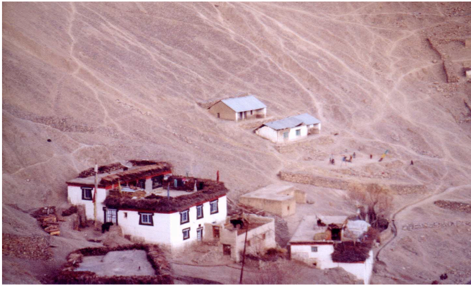
Photo 2. A typical Spitian house in Dhankhar village