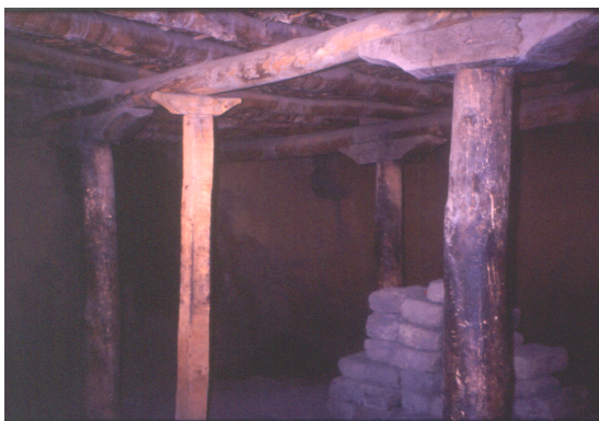
Photo 2: Internal view of the Spitian house, showing the Ka and Kaje supporting the ceiling.